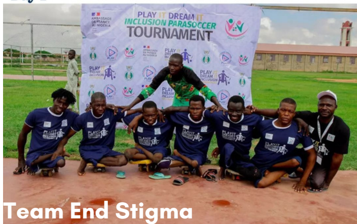
Team End Stigma