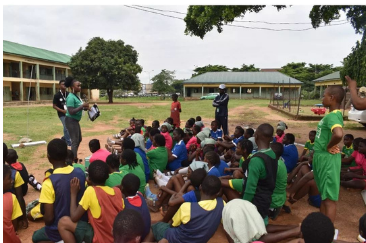
Climate Education, Awareness and Advocacy Program (CLEAP) - School Outreach