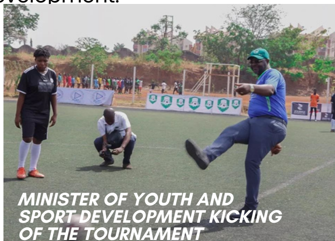
MINISTER OF YOUTH AND SPORT DEVELOPMENT KICKING OF THE TOURNAMENT